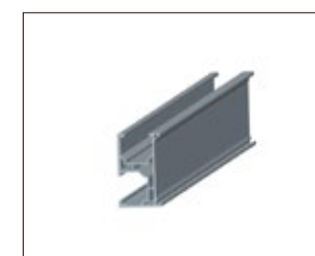
B : Rail