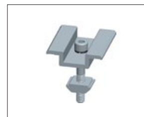
D : Inter clamp