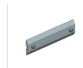
C : Rail splice