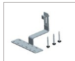
A : Tile roof hook