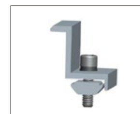
E : End clamp